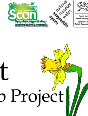
Chart for Daffodils in the Ground

Your Daffodils may start to flower in January so visit your plot regularly to check on them. When they do flower (and you can see the inside of the flower) record it here and send your results in to us via the website, https://museum.wales/spring-bulbs/